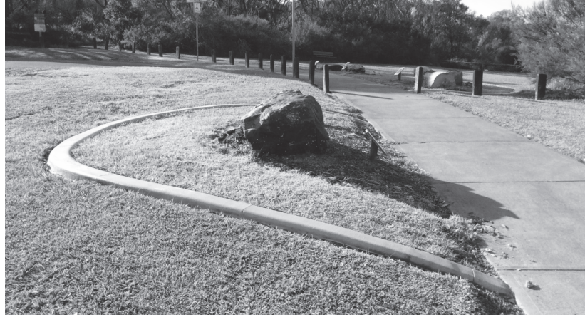
Paleogene basalt garden bed before excavation

Because of the unsuitability of organic mulch, matching rock mulches were used in the garden beds. Suitable sources for these materials had to be identified at more than a dozen sites and, once again, landholders had to be contacted for necessary approvals.