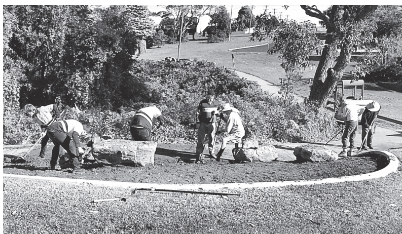
Volunteers excavating a garden bed

However, in another cruel blow and unbeknown to GCFW, the $30 500 unspent from the original fossil walk grant had not been carried forward in the Shoalhaven City Council's budget and funds were no longer available for the project. This news came as an enormous shock and stopped further work until funding was available. Clearly, the support of a majority of the 17 councillors was necessary if Council funding for the project was to be restored.