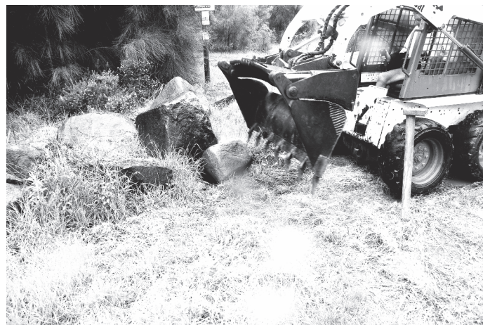
Loading the Termeil Gabbro boulder for the time walk

This region was also considered ideal for a geological time walk, since it has a very interesting yet understandable geological history, stretching back more than 500 million years. Geological events can be traced from the Cambro-Ordovician and Devonian basement rocks to the richly fossiliferous flat-lying Permian strata of the southern Sydney Basin, to Mesozoic and Cainozoic intrusives, a Neogene shelly limestone and Neogene silcrete and ferricrete duricrusts.