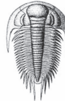
Paradoxides - trilobite