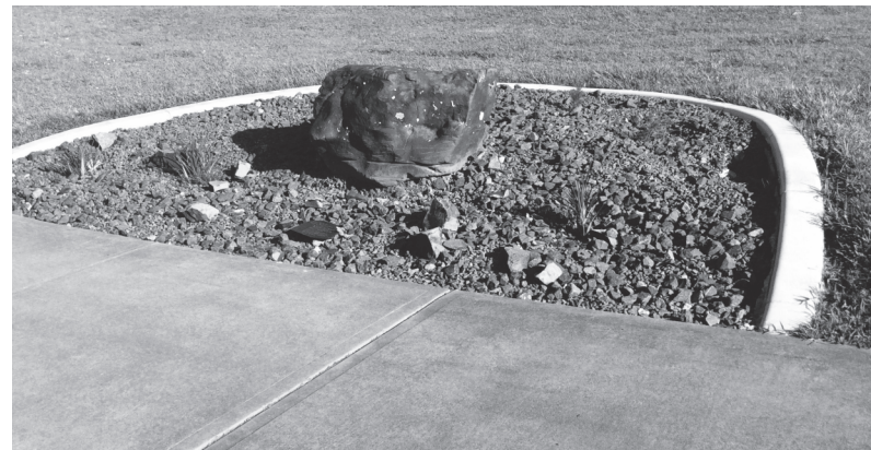
Palaeogene basalt garden bed

Two garden beds presented a real challenge. The Neogene Shelly limestone boulder on the time walk had been dredged up by local fishers. It had lain about 300 m under water, on the edge of the continental shelf 30 km east of Ulladulla, where it formed part of a horizontal limestone bed. When asked if they would bring up another boulder big enough to crush into a mulch, the fisherfolk advised the group to seek another solution. Lateral thinking led to a beach in Meroo National Park, south of Ulladulla, which had been mined for shell grit over many years. NSW Parks and Wildlife approved our request and sufficient shell grit was recovered from the beach.