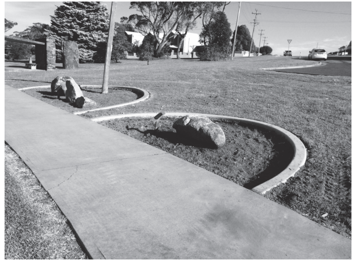
Excavated granite garden beds before mulching