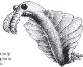
Sanctacaris – early relative of scorpions and spiders